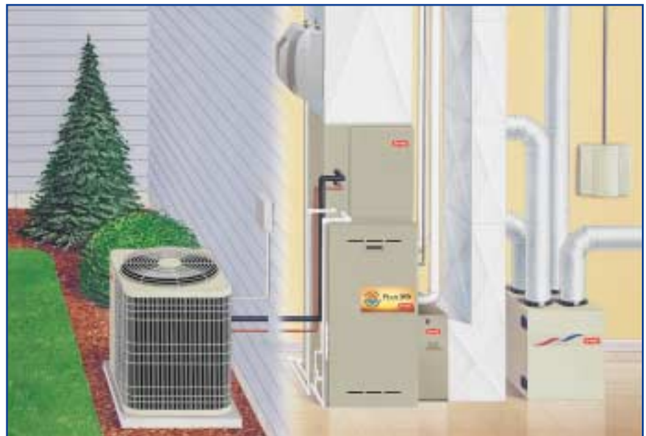
Central Air Conditioner and Gas Furnace System