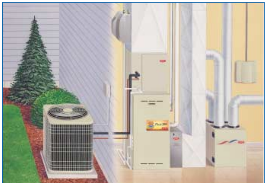
Central Air Conditioner and Gas Furnace System